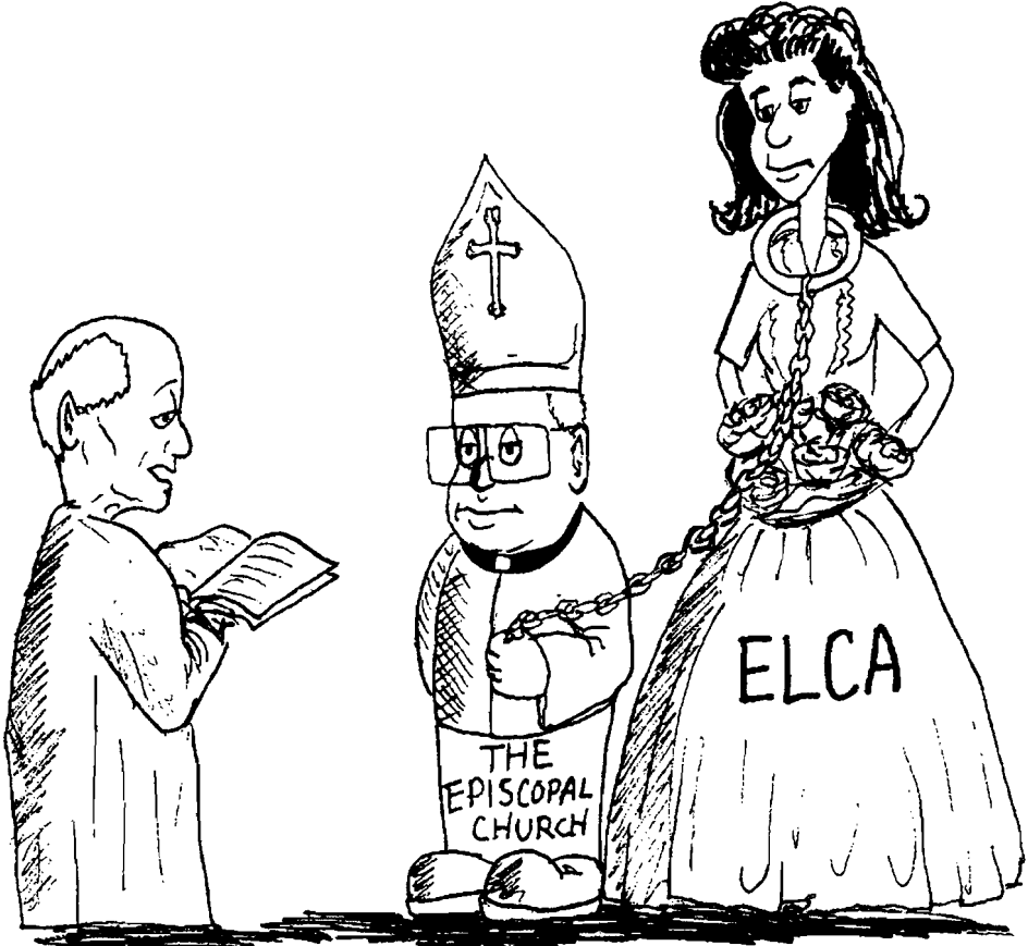
Repeat after me: "I, ELCA, freely accept the historic episcopate." (CCM ¶18)